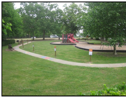
Chapel Street Park on the City's Northside is used by neighborhood groups, throughout the year.

The intersection at the entrance to Chapel Street Park was a nightmare to cross. A wide turning radius was more like an on-ramp, and the wide street allowed cars to get up to 60 and 80 miles per hour, such that some residents referred to Fremont Avenue as I-85. Cars had unclear driving lanes, and pedestrians were left up to their own devices.