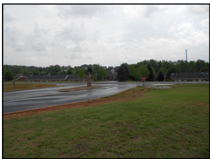
There are seven subdivisions and a senior residence complex within a half-mile of the entrance to Va-Du-Mar McMillan Park in Boiling Springs.